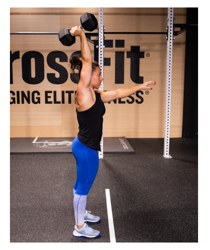
This is a single-arm overhead walking lunge. Each lunge begins with a dumbbell overhead, the feet together and the athlete standing tall with hips and knees extended. The athlete must be behind the mark denoting the start of the segment being attempted.