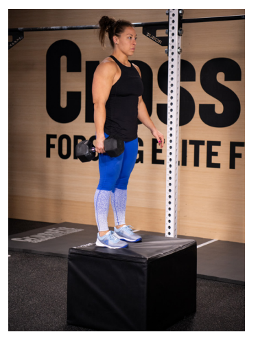
The rep is credited when both of the athlete's feet are on the top of the box and the hips and knees are fully extended. Athletes must alternate legs to start each step.

For every repetition of the dumbbell box step-up, the athlete starts with both feet on the ground and faces the box. With the dumbbell supported in any position but not resting on the leg, the athlete must step to the top of the box. Only the athlete's feet may make contact with the box. If the athlete is holding the dumbbell with one hand, the free hand may not push into the legs during the step-up.