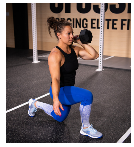
For divisions using the front-rack lunge, the dumbbell is supported on the shoulders in front of the body.