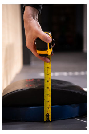
Set up a target of appropriate height for your division. The head must touch the target depth before returning to the finish position.

For divisions that require an elevated handstand push-up, the start and end positions are the same as described for the strict handsand push-up.