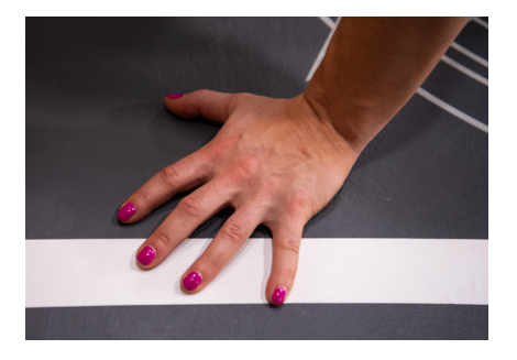
The palms of the hands must stay within the dimensions of the box marked on the ground, but the fingers may extend past the line.

Kipping is not allowed. Any repetition that is assisted by the hips or legs will not count. Only the heels may touch the wall during the repetition.