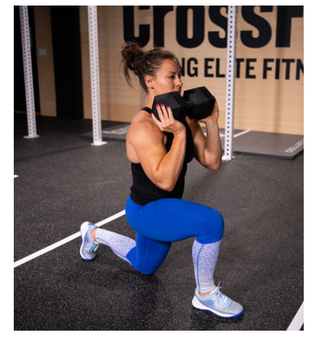
Athletes may support the dumbbell with one or two hands. At least one hand must remain in contact with the dumbbell at all times.